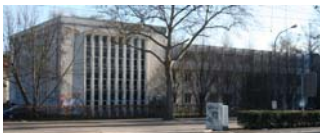
Figure 3. Use case building

For demonstrating the OSM indoor extension, the building of the Chair of GIScience of the University of Heidelberg (Cf. Figure 3) has been mapped. It has four different levels (one basement and three above the ground) and one main entrance. It mainly contains offices and three bigger rooms for lectures. The levels are connected with two different staircases. The location of the building was gathered via GPS. Information about the specific dimensions and the inner structure of the building were gathered by CAD floor plans, kindly provided by building authorities.